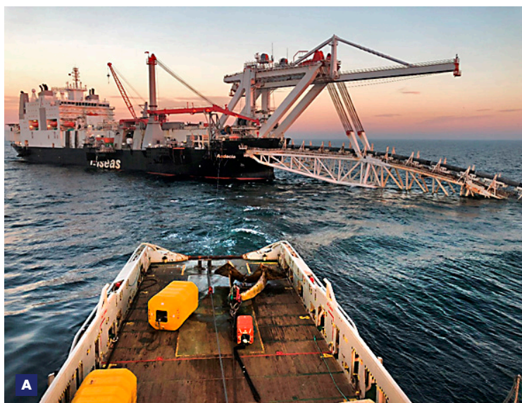
A PLV Audacia B Location map