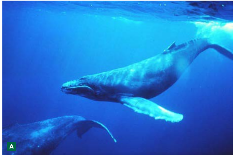
A Humpback Whales in Gabon